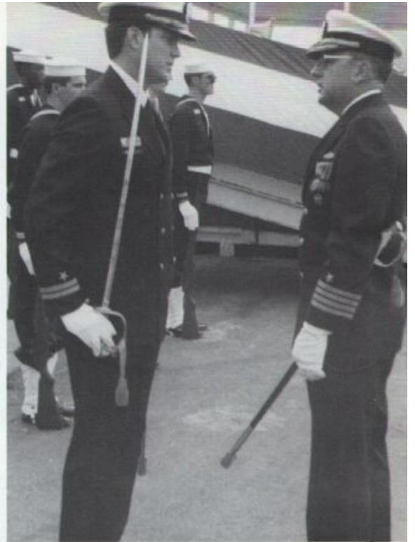
CO inspects the Honor Guard