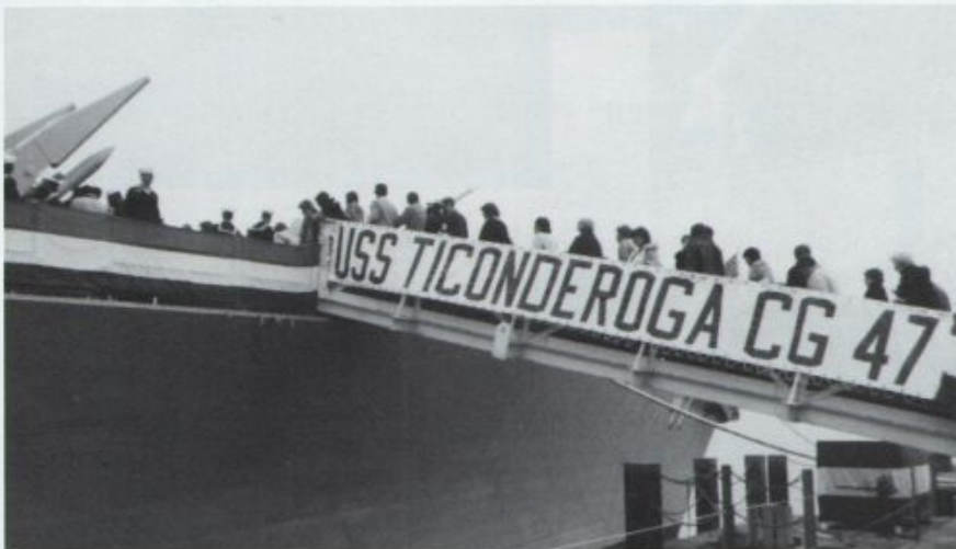
▲ Then They Attacked