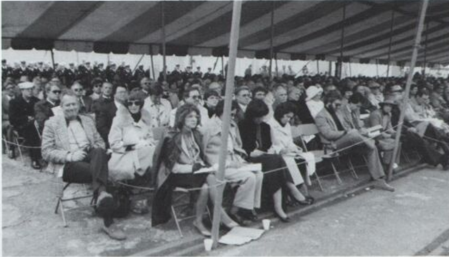
◀ First They Waited . . .