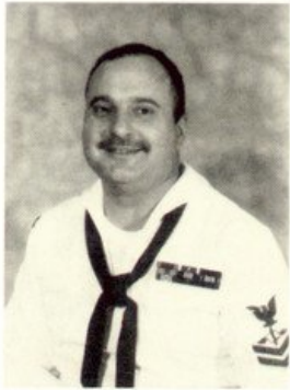
GAWEL AZ2 HANCOCK AMSAN HONEA AW3