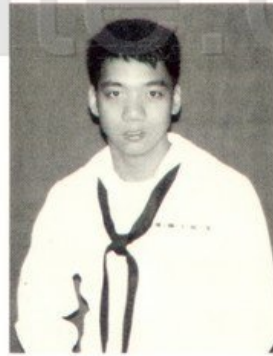
PNZ WINSLOW YNSA URSO PNSN MANUEL