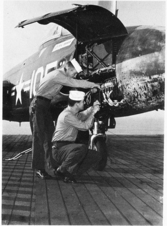
If E equals I R then where are the sparks coming from?