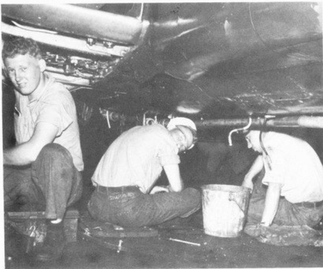
Well, it always went back together before.