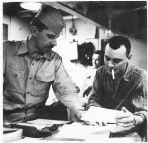
Where's that penny?