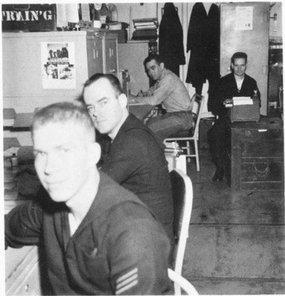
Photographer, you're interrupting our paper shuffling.