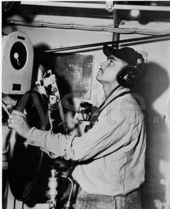
Rose at aft steering